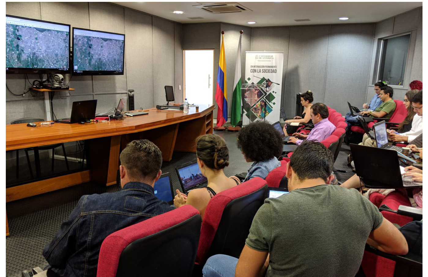
A Bellingcat workshop in Medellin, Colombia facilitated by Fiorella in April 2019.

I encourage anyone in the CrimSL community who works with social media and other open source data to look to Bellingcat for examples how to use and verify that type of information.